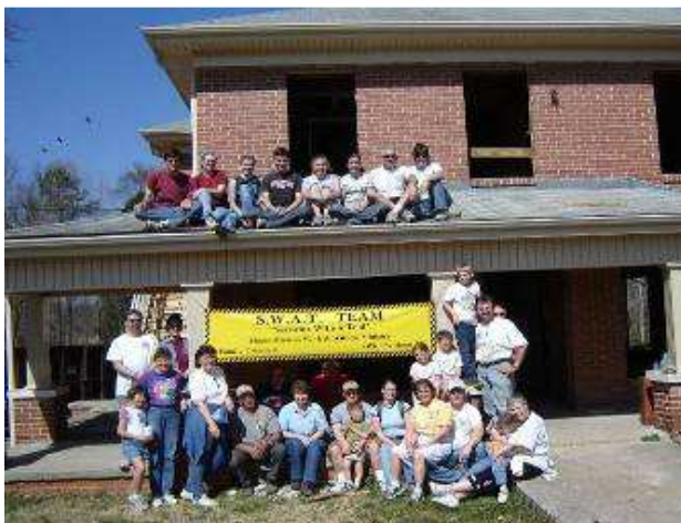
SWAT Team poses in front of the counselors' house where much of the work occurred