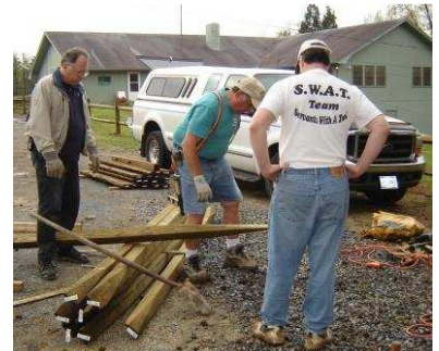
Victory Mountain Camp