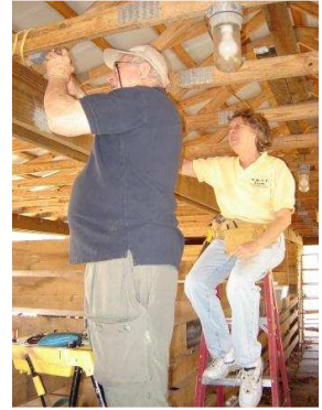
Camp Oak Hill