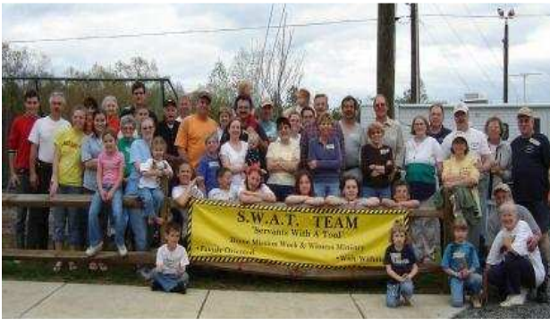
The 43 participants of the Victory Mountain event pause after lunch to take a group shot